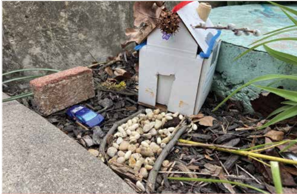
Second Saturday Family Adventures: Fairy Houses at Greater Newark Conservancy

Renaissance to the present day, as well as folk songs from several cultures. St. Mary's Church, 520 Martin Luther King, Jr. Boulevard., Newark. 3pm. Free admission, donations accepted at the door. 973.353.5194.