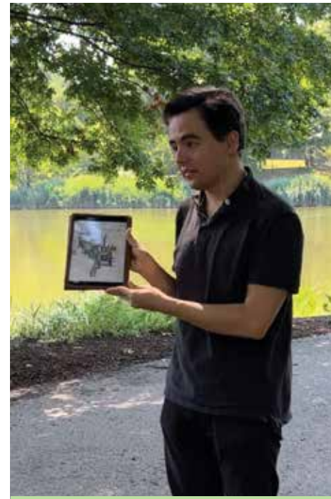
Historic & Horticulture Tours with the Branch Brook Park Alliance team

Volunteer and join Branch Brook Park Alliance during the Cherry Blossom Season in the protection and preservation of the world-renowned collection. Together, we will meet guests from all over the world. Essex County Branch Brook