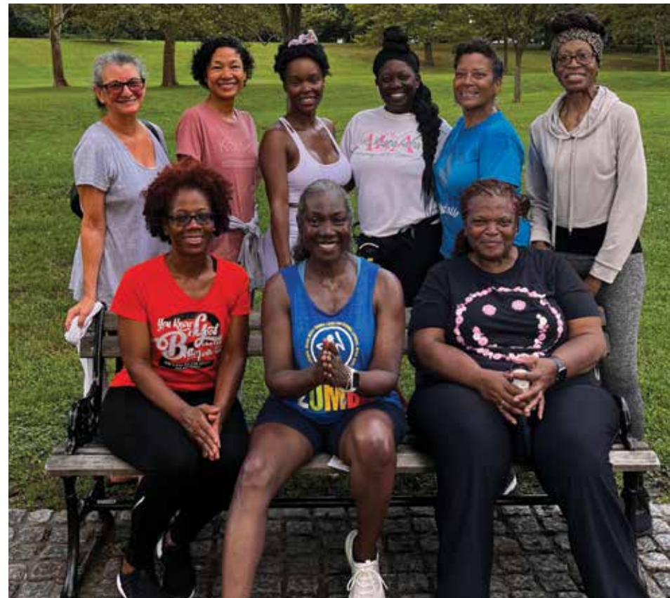
Discovering Wellness in Essex County Branch Brook Park

Join the Branch Brook Park Alliance team for a 45-minute walking tour and learn more about the historical significance of Essex County Branch Brook Park and the formal gardens. Essex County Branch Brook Park, Prudential Concert Grove. Flexible dates and times. Fee $15 per person. Discounted rate for groups, please inquire. Advanced registration is required.