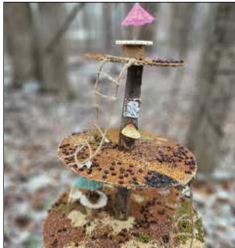
PreK to 2nd Grade Second Place: Iris Brondo