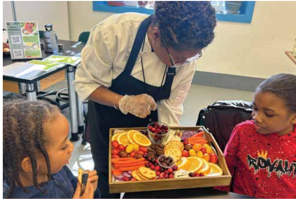
Family Fun in the Kitchen at The Greater Newark Conservancy