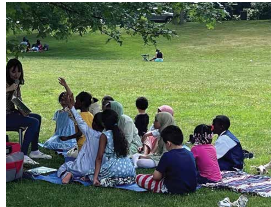
Children's storytime with the Branch Brook Park Alliance

Competitions are in-person at Caldwell United Methodist Church, 8 Academy Road, Caldwell, NJ. ■