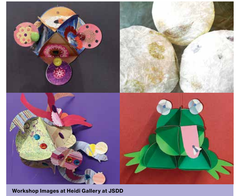
Workshop Images at Heidi Gallery at JSDD

Cooperman JCC 760 Northfield Avenue, West Orange 973.530.3412 / www.jccmetrowest.org