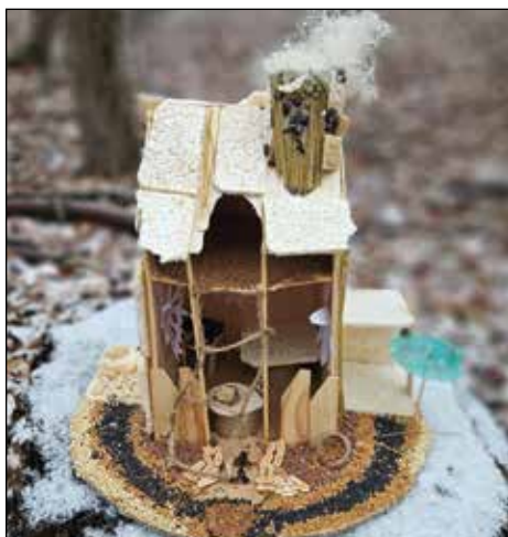
Grade 3rd to 5th First Place: Ursa Brondo