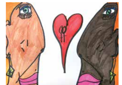
Pride-Full at Heidi Gallery at JSDD