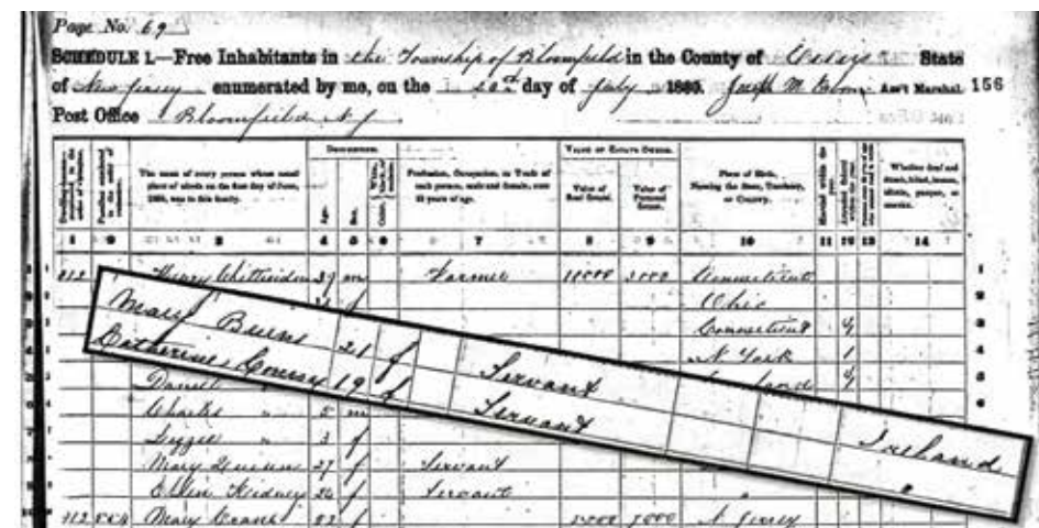
Guided House Tour: Women of the House at the Crane House & Historic YMCA