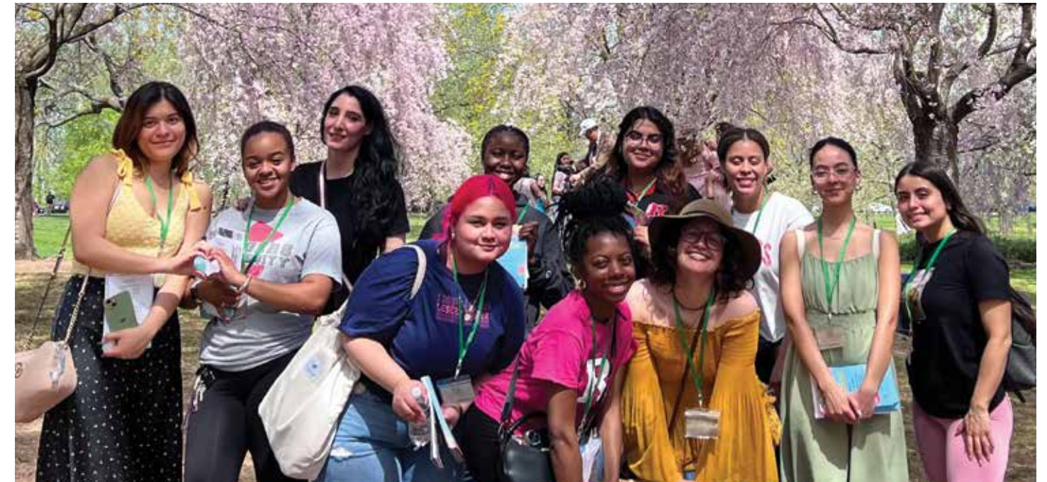
Volunteer Stewardship in Essex County Branch Brook Park